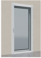
Double Frame Double Frame

LUD2504, Outward Opening Patio Door 2+1, Double Frame