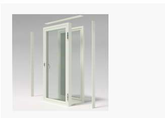
Double Frame Double Frame