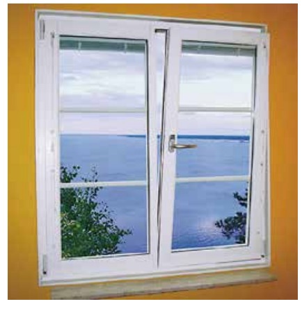
B - Tilt position.