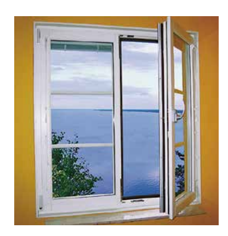
C - Side opening.