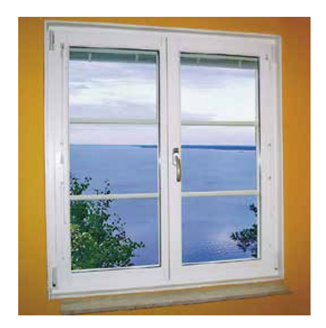
A - Closed position.